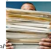
"No more, No more!"